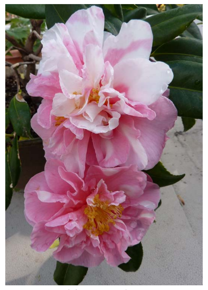
'Shibori Egao Corkscrew'

The camellia cultivar 'Egao' will continue to be an enigma and it seems appropriate to contend that as you pick one of its blooms and examine it closely, it stares up at you with a superior smirk. After all the name 'Egao' means "Smiling Face"!