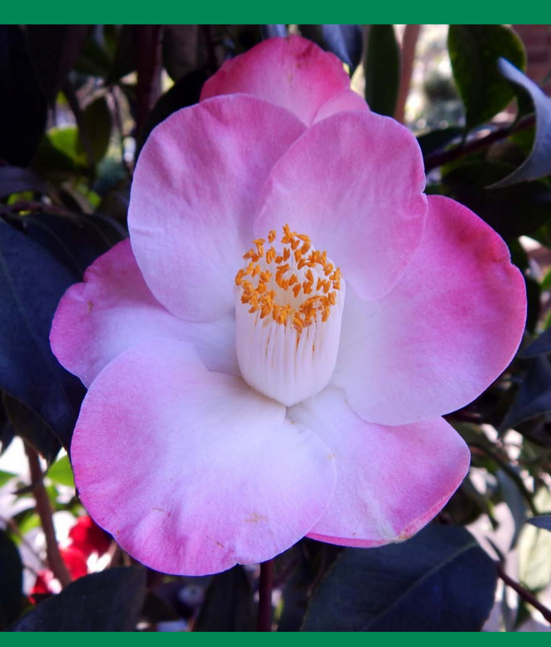
C. japonica 'Sunnyside'