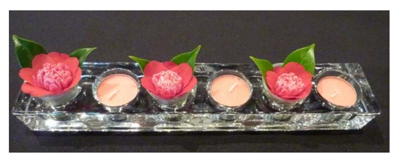
Trio of 'Shikibu'

The use of flowers at the dinner table adds beauty to the occasion. Central flowers need to be short enough for people to see and converse with other people across the table. A beautiful camellia in a family treasure helps remember family no longer with us as we enjoy conversation and a delicious meal.