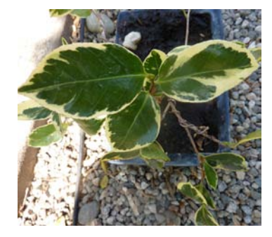
Benten foliage bonsai

Higo camellias on their own roots make excellent bonsai as can be seen in the image of 'Ohkan'. The foliage camellias also make good displays throughout the year as a bonsai.