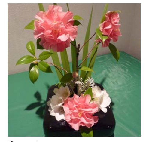
Examples of Camellia Flower Arranging