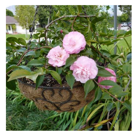
'Sweet Emily Kate'

a plant with dark green foliage and pink flowers. However, they dried out quickly in the cocoa mats and struggled if not watered daily in the heat of the summer. A hanging basket loses more moisture than a regular pot due to its full exposure to sun and wind. I found plastic containers more forgiving especially those with a water saving lower compartment.