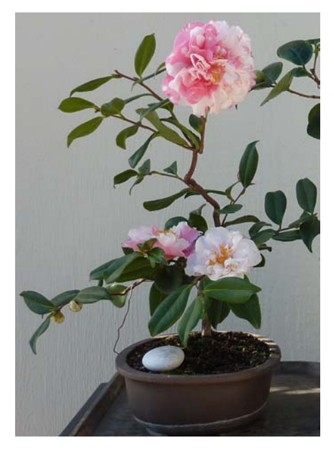
'Shibori Egao Corkscrew' Bonsai

Camellias unusual with growth habits and pretty flowers also make wonderful additions to a patio. 'Egao Corkscrew' and 'Shibori Egao Corkscrew' are good examples. 'Egao Corkscrew' has zig-zag branches and a medium pink The pink mottled white variegated flower of 'Shibori Egao Corkscrew' with its corkscrew branches is both interesting and attractive in a pottery container. It