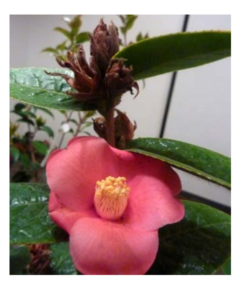
C. edithae flower and buds

C. edithae is a very late blooming camellia species that has medium rose form to formal double rose red flowers. It grows upright and very bushy with hand-