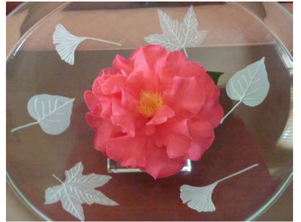
Flower arranging with camellias has become a part of the last three camellia shows in Southern California. The beauty and creativity improves the show as can be seen in the two photos. Flower arranging with camellias can also be done for the home providing innovative pieces of art.