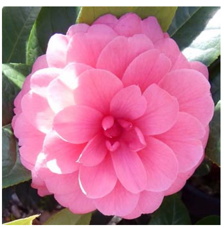
C. edithae 'Heimudan'