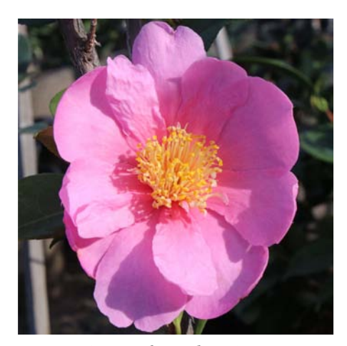
'City of Newburg'

Others which may find their way into next year's catalogue are #0505, also called 'Giant Tinsie', a big open plant with blooms just like 'Tinsie's' except much larger and #2017 a red and white striped bloom like 'Ferris Wheel' but somewhat smaller. There is no such thing as a blue camellia, but a few possible future introductions have a bluish tone. #0915 is a single, bluish red bloom with bright yellow stamens. #0805 has a distinctly lavender cast, this attractive, bushy plant is a seedling of 'Mahogany Glow' which likely accounts for its distinctive color. Finally, is a tiny new Tama seedling, possibly called 'Tama Pinwheel'.