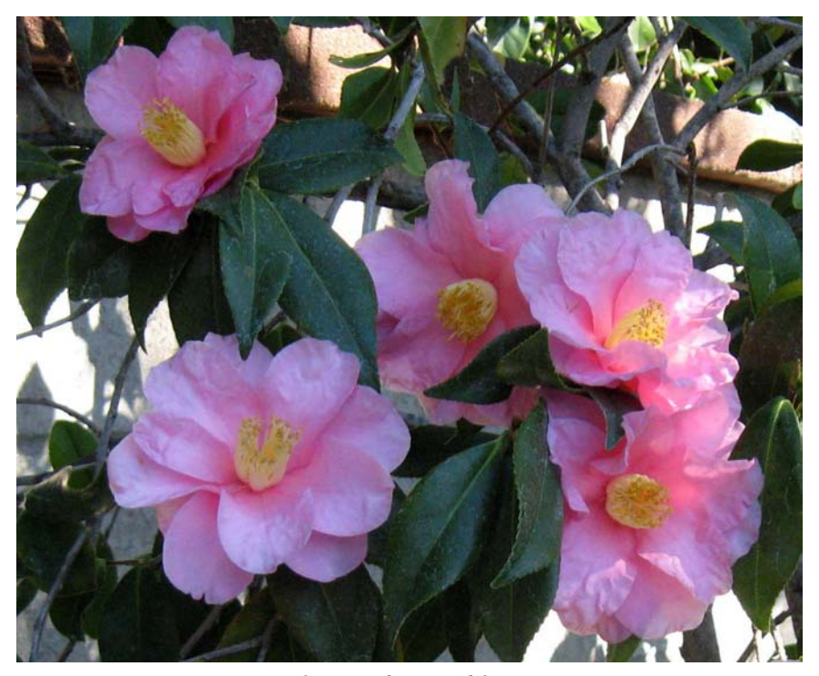
Cluster of 'Egao' blooms

Editor's Note: This article is reprinted from the 1987 Camellia Review because 'Egao' continues to be a frequent winner in the species class at camellia shows. It is an excellent landscape plant that produces many lovely pink blooms on a vigorously upright somewhat spreading plant that tolerates full or partial sun.