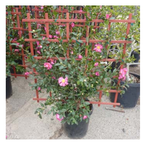
Espalier Camellia for sale at Nuccio's